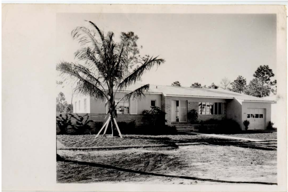
Figure 2: First image scanned in 2005 was 1106 Aduana (front or recto side) : FI05130001_001

Start this project with “FI09130001” and increase the last four digits as you work from one street to the next. So the first image on the first street will be saved as “FI09130001_001.tif”, the second image will be “FI09130001_002.tif”, and so on.